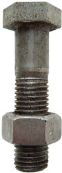
Standard Bolting Sizes for BS4472 Ductile Iron Pipes & Fittings